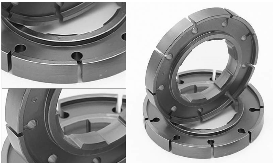
Fig. 8 The vane rotor is used in an engine lubrication system. Of importance is the accuracy of the rotor radial dimensions, ID spline and vane slot features

testing services for both advanced work and product development and validation testing. The company has developed the capabilities to conduct nearly every testing requirement of every major OEM. That includes valve and spring endurance testing, contamination resistance, thermal cycle, vibration, performance, and durability testing (Fig. 7).