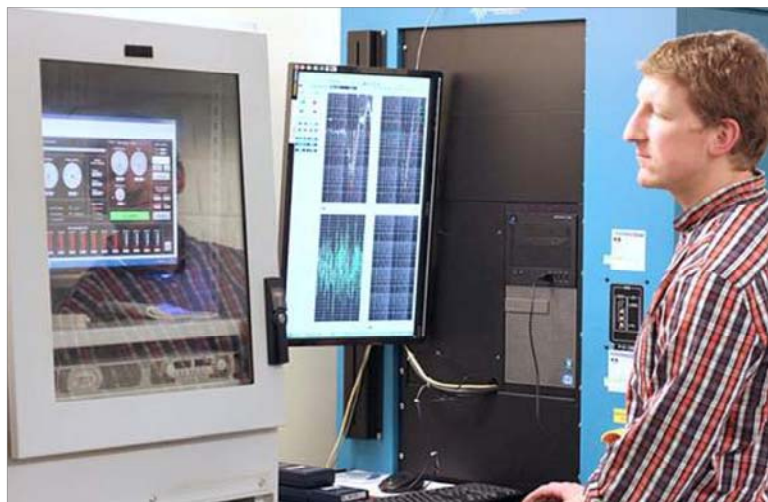
Fig. 7 Nichols Portland has a wide range of in-house testing and analysis available to ensure components meet customer requirements

Over the years, many major automotive OEMs from around the world have contracted Nichols Portland's