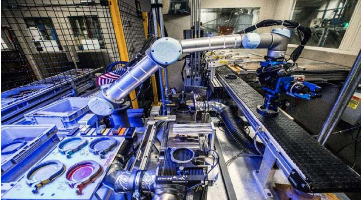
Fig. 3 Automation in the PM production line helps lower manufacturing time and increase speed to market

In-house secondary operations include heat treatment, surface treatment (including steam treatment and phosphate), CNC mill, turn, grinding, broaching, hobbing, hone and lapping.