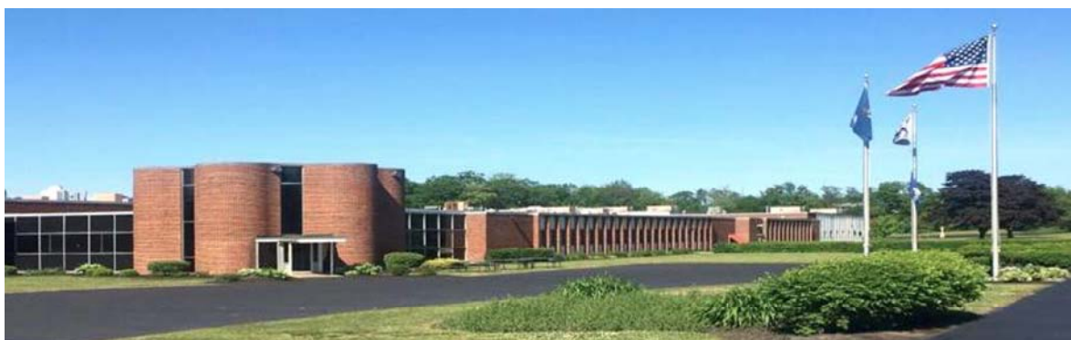
Fig. 1 The Nichols Portland facility in Portland, Maine, USA

than thirty years Nichols Portland has had product development and product validation teams focused exclusively on helping its customers develop and validate their products. To that end, the company has developed testing facilities and engineering capabilities to the point where Nichols Portland can conduct most of the pump validation testing required by the major OEMs in-house.