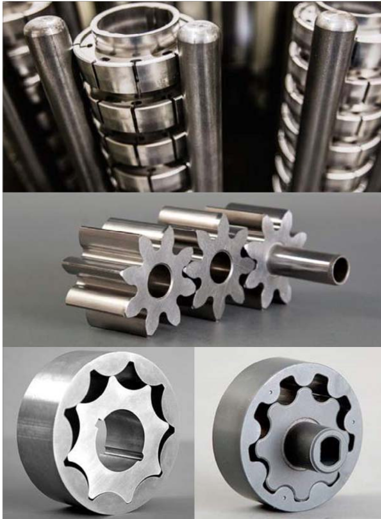
Fig. 5 Nichols Portland manufactures a wide range of PM components to high tolerances. Shown top is a VDP rotor, middle is a spur gear, bottom left a steel gerotor, bottom right a hubbed steam treated gerotor

not discovered until the testing and validation stages. The company does this by leveraging the accumulated experience of its application team, several of whom have been with Nichols Portland for more than thirty years. It has a large library of test data from benchmarking commercially available products in the markets it serves (Fig. 4). Quite often, that includes designing test fixtures and testing pumps in order to quantify performance, and the contribution of specific features to that performance. Nichols Portland's reports, which follow several SAE and ISO testing procedures, generally total more than one hundred pages.