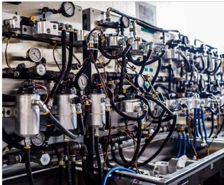
Fig. 4 Pumps are tested at Nichols Portland to ensure that components meet the high quality and performance expected

Nichols Portland typically works with its customers during the advanced design stages of a programme. Its goal is to help customers avoid design related issues. This reduces the problem-related costs that are usually